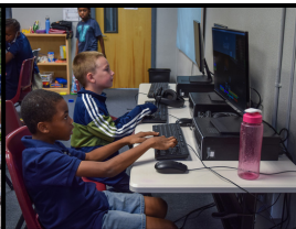
Internet & Utilities